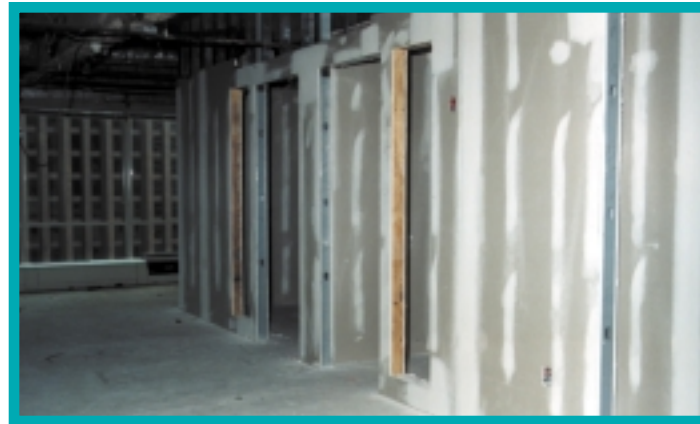
Steel studs, made with recycled content, were used for framing as much as possible.

With more than 1,200 windows in EPA's space (measuring 9' x 5' each for a total of 54,000 square feet of window space), purchase of new blinds would have required an additional outlay of $90,000 for materials alone (assuming a low-end figure of $75 per blind).