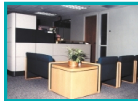
Waiting areas throughout the facility show off many quality aspects of EPA's green lease renovation.

Using the figures cited above, a simple 2% gain in productivity by EPA's 1,200 employees in 300,000 square feet of space due to well-maintained air quality and responsive climate controls would translate into roughly $780,000 annually. Productivity gains from other health and efficiency improvements in the facility may also increase these dramatic benefits.