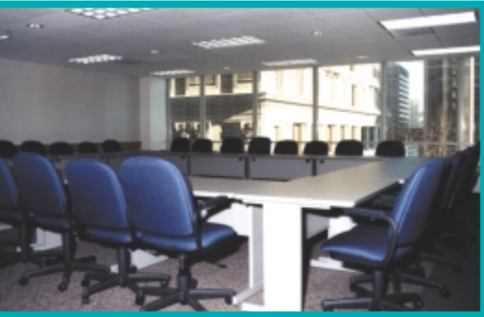
State-of-the-art conference room maximizes daylighting.

“Sick Building Syndrome” has become a major environmental concern in office buildings throughout North America over the last several decades. In simple terms, this condition is caused by numerous factors that contribute to poor air quality in places of work which often affects the health of workers. In some cases the effects can be acute, in others they can be more subtle. As would be expected, EPA is deeply concerned about the health of its employees. In addition, “Sick Building Syndrome” can reduce worker productivity and increase absenteeism. Project planners were thus exceedingly careful to include air quality concerns in designing the new space.